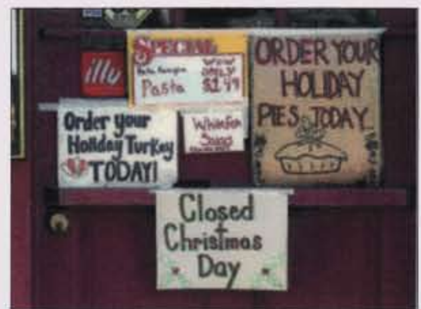
Handmade signs announce various specials and holiday deadlines on the market's front door.

The store recently launched a Web site, giovanniscountrymarket.com, where customers can learn about specials and access menus and other information.