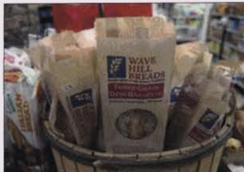
Wilton brand Wave Hill Breads is available at Giovanni's.